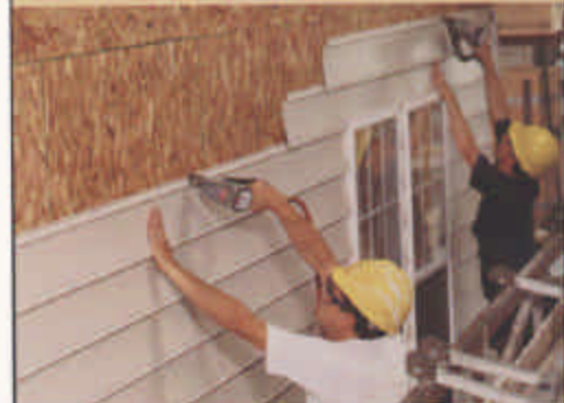
R-Anell's expert siding installers use Norandex vinyl siding. It's known as the best in the industry.