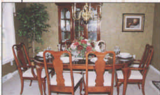
Customization is second nature; we design rooms to fit your needs.