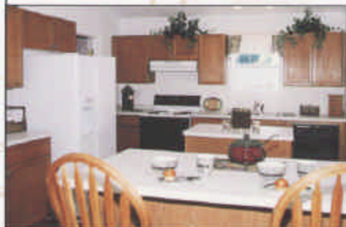
Spacious kitchen areas accommodate a variety of entertaining needs.

The sales representative at our local builder was great. He's an expert on R-Anell and Gold Medal Homes. He talked to us about what we liked and helped us look at the plans that would be best for us.