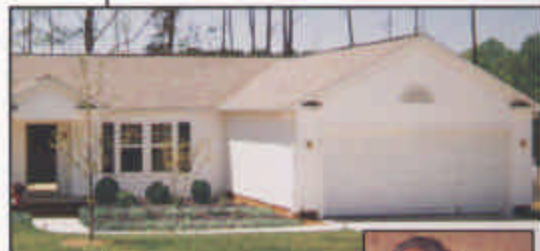
Many models are designed to accommodate garages.