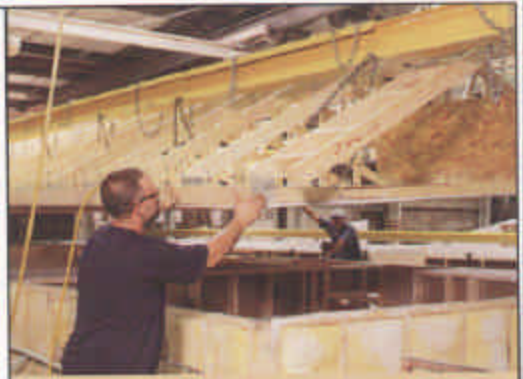
The roof is built as a unit and put into place, for extra strength.