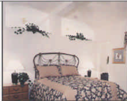
Design amenities make rooms light and bright.

They put three hinges – not just two – on the interior doors. And those doors have removable pins in case you ever have to take the door off to get a big piece of furniture through the opening.