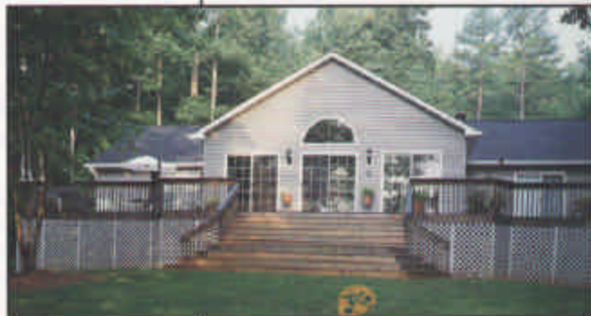
A variety of pitches, windows and door styles provide dramatic contemporary looks.