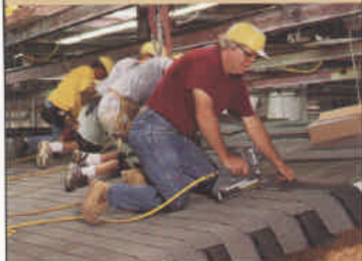
The roofing team is precise and efficient when they attach GAF shingles that will protect your home from the elements.